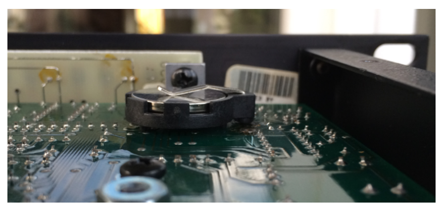
The following shows the soldering of the new battery holder seen from the top of the circuit board with the minus pole pin soldered to the same solder joint as previously the old battery's negative pole was soldered and the plus pole pin of the holder soldered to the frontmost of the two solder joints: